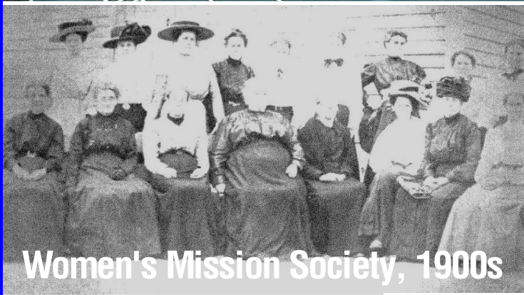
Women's Mission Society, 1900s